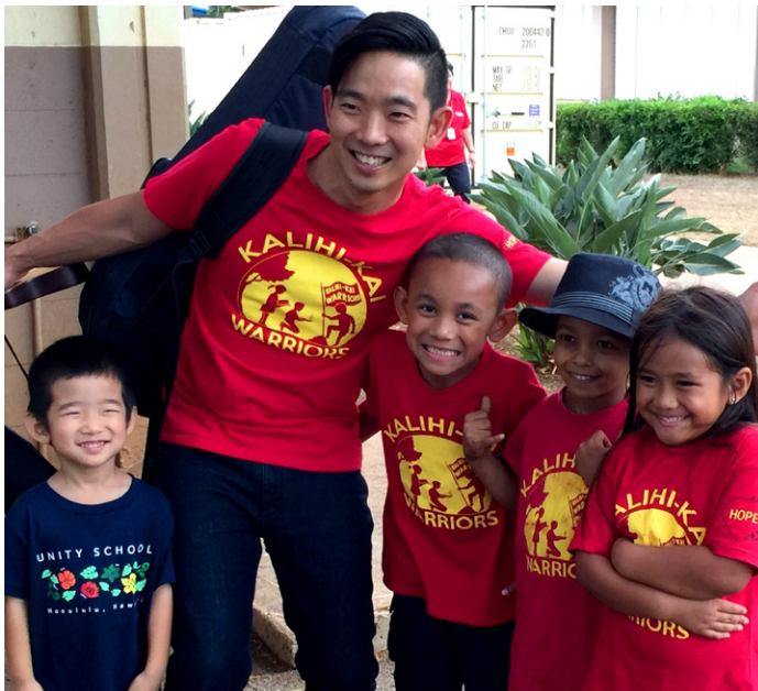
Turnaround Arts Mentor musician Jake Shimabukuro (and his son) with Kalihi Kai Elementary students at a Turnaround Arts Hawai'i event