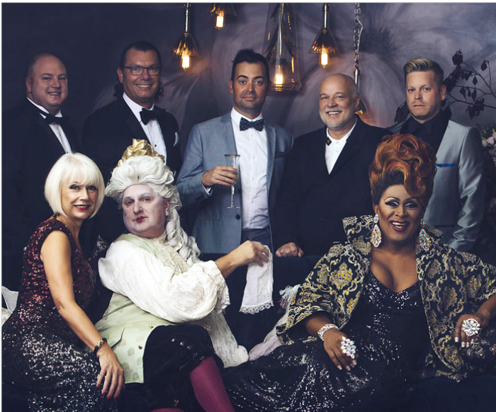
Set by Anthropologie at the 2017 Portland Opera Gala