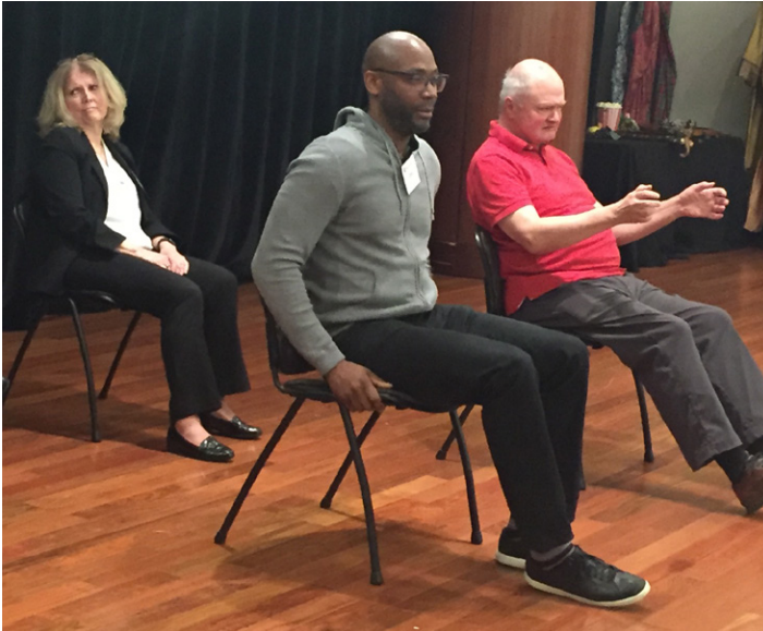
Photo credit: M Powered Strategies improv class with Washington DC's Shakespeare Theatre Company