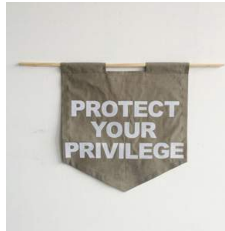
Satpreet Kahlon, The Five Pillars of White Supremacy