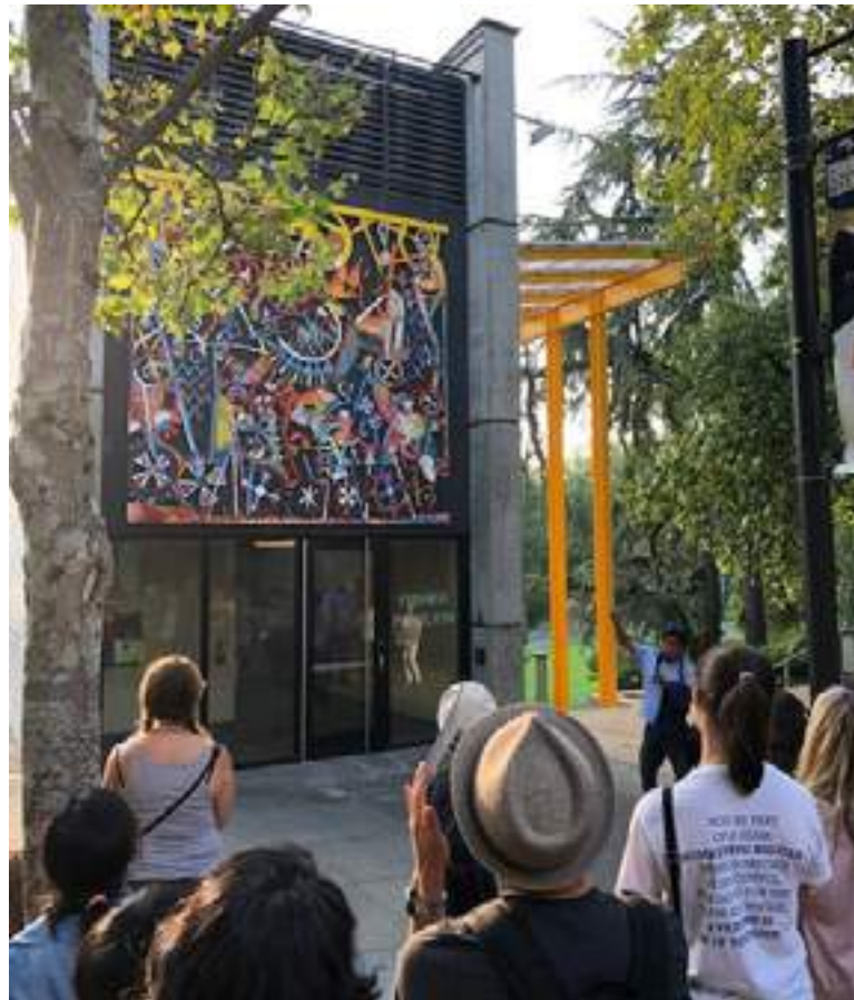
Fulgencio Lazo, Mercado de Esperanzas

Institutional barriers take time to overcome: even with a focus on enrolling artists of color, they make up only 42% of all boot campers to date.